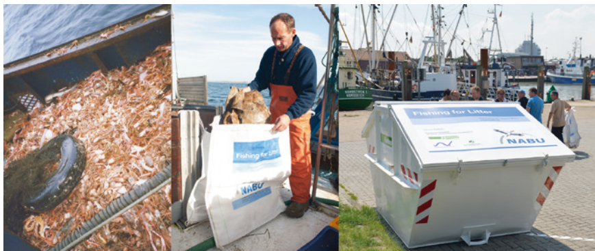
Fig. 14.2 OSPAR Fishing for Litter program. From left to right catch with a tyre from a Nephrops trawler in the Clyde (U.K.) ; fisher from FV Andrea sorting litter into bags provided by Fishing for Litter scheme ; portside container for litter collected by fishers

These schemes are currently in operation in the U.K., Sweden, Denmark, The Netherlands, Belgium and Germany, and potentially other EU countries as there is EU support to fund such operations (KIMO International 2013; European Commission 2011).