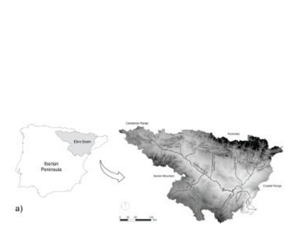
Figure 1. Relief of the Ebro River basins and main tributaries of the Ebro River.

During the period 1950-2006, a marked decrease in river discharges has been observed in almost all subbasins of the Ebro river, as well as warmer temperatures and a moderate decrease in precipitation. However, there is strong evidence that climate alone does not explain the observed magnitude of the decrease in water resources availability. Research developed through the ACQWA project has revealed that water yield in mountain areas has decreased in the last decades as a consequence of an increase in evapotranspiration rates in natural vegetation, which has expanded during the 20<sup>th</sup> century in areas where grazing and traditional agriculture have disappeared. Climate projections for the end of the 21<sup>st</sup> century suggest a reduced capacity for runoff generation because of increasing temperature and less precipitation. Thus, the maintenance of water supply under conditions of increasing demand presents a challenging issue requiring appropriate coordination amongst politicians and water managers.