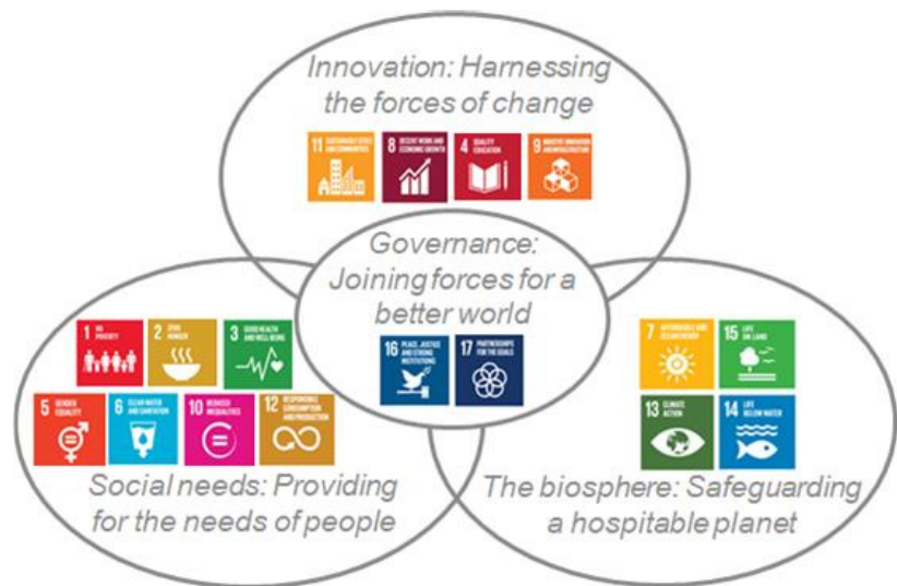
Figure 1: The Clustering of SDGs in the BOHEMIA study (2017)

have a high level of trust for science, there is growing discomfort about the perceived lack of independence of science, its potential dangers and the lack of communications from scientists to the public. 5 In Eurobarometer's 2015 survey of public opinion, citizens expressed concerns about the drawbacks from science and technological change, including "privacy and data security concerns, unemployment, growing technological dependency and deskilling, worsening of relationships, social exclusion, a sedentary lifestyle, and effects on the environment." 6