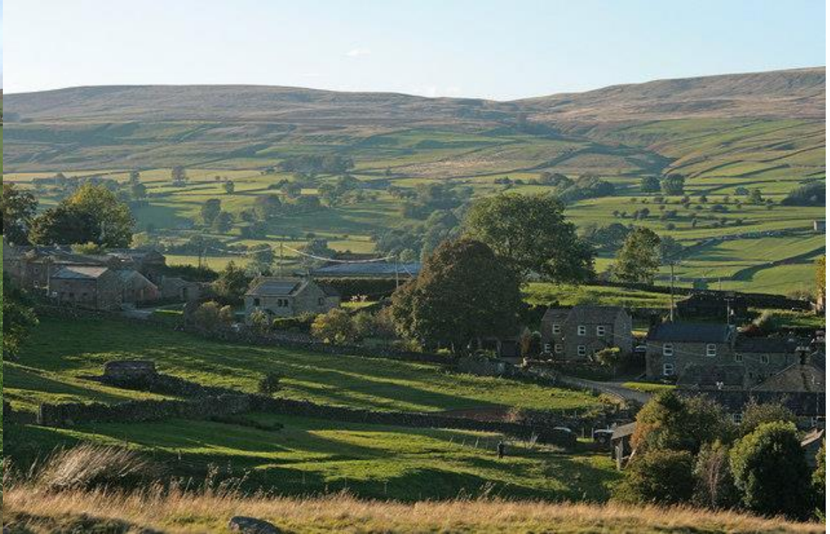
West Scafton, Coverdale, North Yorkshire