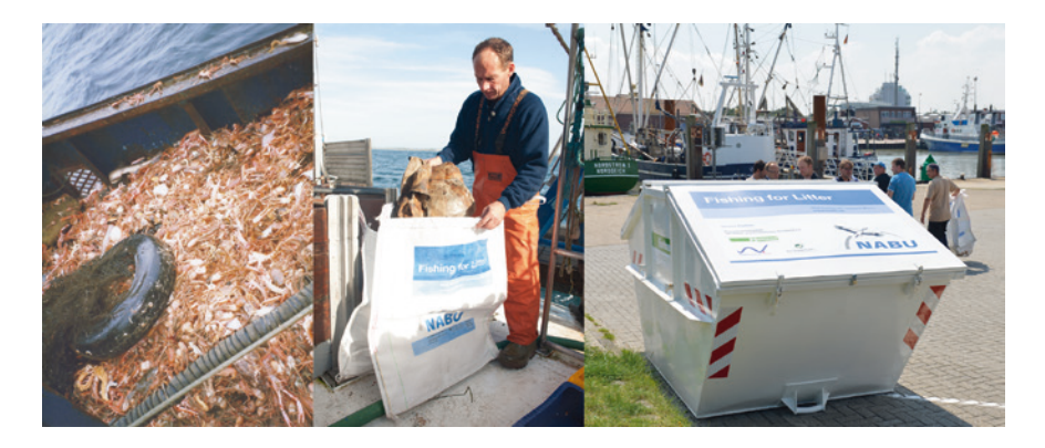
Fig. 14.2 OSPAR Fishing for Litter program. From left to right catch with a tyre from a Nephrops trawler in the Clyde (U.K.) ; fisher from FV Andrea sorting litter into bags provided by Fishing for Litter scheme ; portside container for litter collected by fishers

These schemes are currently in operation in the U.K., Sweden, Denmark, The Netherlands, Belgium and Germany, and potentially other EU countries as there is EU support to fund such operations (KIMO International 2013; European Commission 2011).